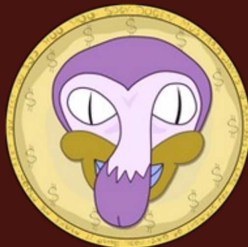
The Official DogenMustard Token Icon

There is only one. But, he does have mates!